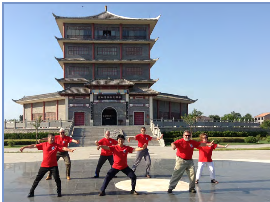
Thunder Bay delegation doing Taiji in front of the Chen Village Taiji Museum.